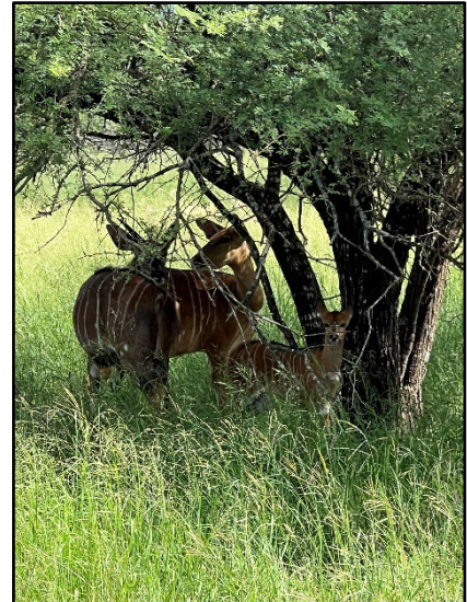
Nyala Mom and Calf

The land of Texas in general, but especially South Texas is an amazing thing to see when it gets rain. The recovery is nearly instant and only takes a couple of weeks to go from looking like a desert to the jungle and clearly the animals love it.