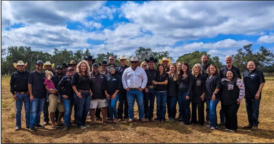
Some of the WLP Staff at the Auction

I hope this update finds everyone well and enjoying some awesome Fall temps like we are getting at the ranches this week. Fall means many things to many people, turning of the leaves, football, wildlife migrations and at WildLife Partners, our semi-annual auction.