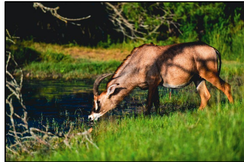
Heavy Bred Roan Cow

The land of Texas in general, but especially South Texas is an amazing thing to see when it gets rain. The recovery is nearly instant and only takes a couple of weeks to go from looking like a desert to the jungle and clearly the animals love it.