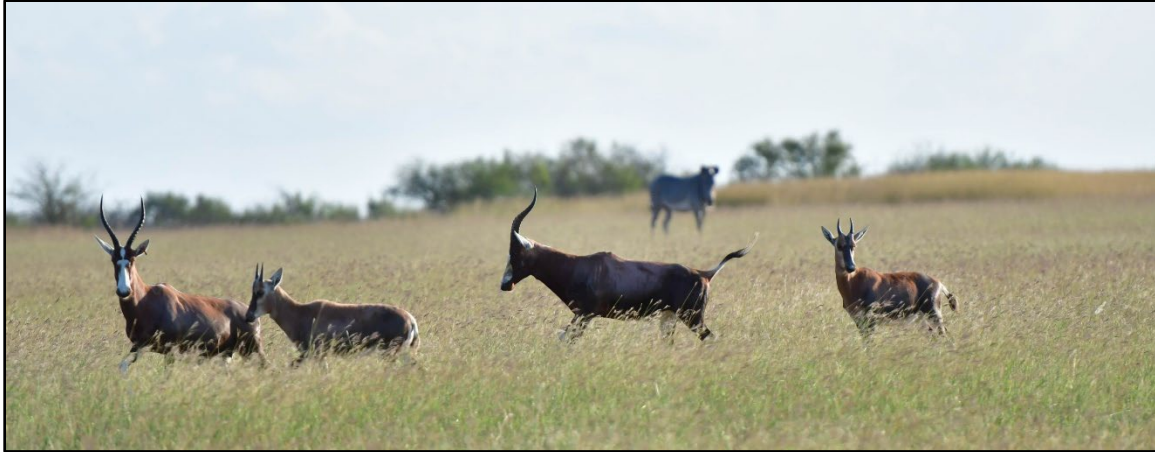
Blesbok Moms and Calves

Our last update showed our staff dealing with what was a very dry, hot, and quite frankly difficult Summer because of the extreme heat. Well, we were all blessed with an amazing August with all the ranches getting at least 10” of rain and some getting closer to 20”. The differences are amazing. Rains like that in August are very rare but for some reason have happened the 2 years. We are clearly very thankful.